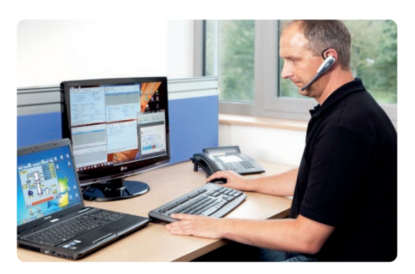
Our e-service allows real time troubleshooting, updates and process optimization through the internet.

The top quality, efficient and environment friendly VACUDEST® vacuum distillation systems are the right choice, anywhere and anytime.