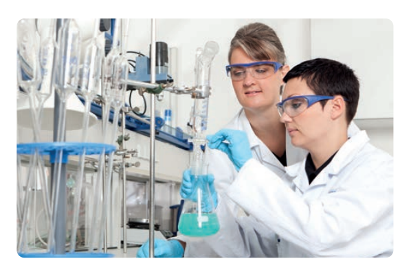
In a first step we analyze your industrial wastewater. Based on the results we develop the best solution for your individual requirements.