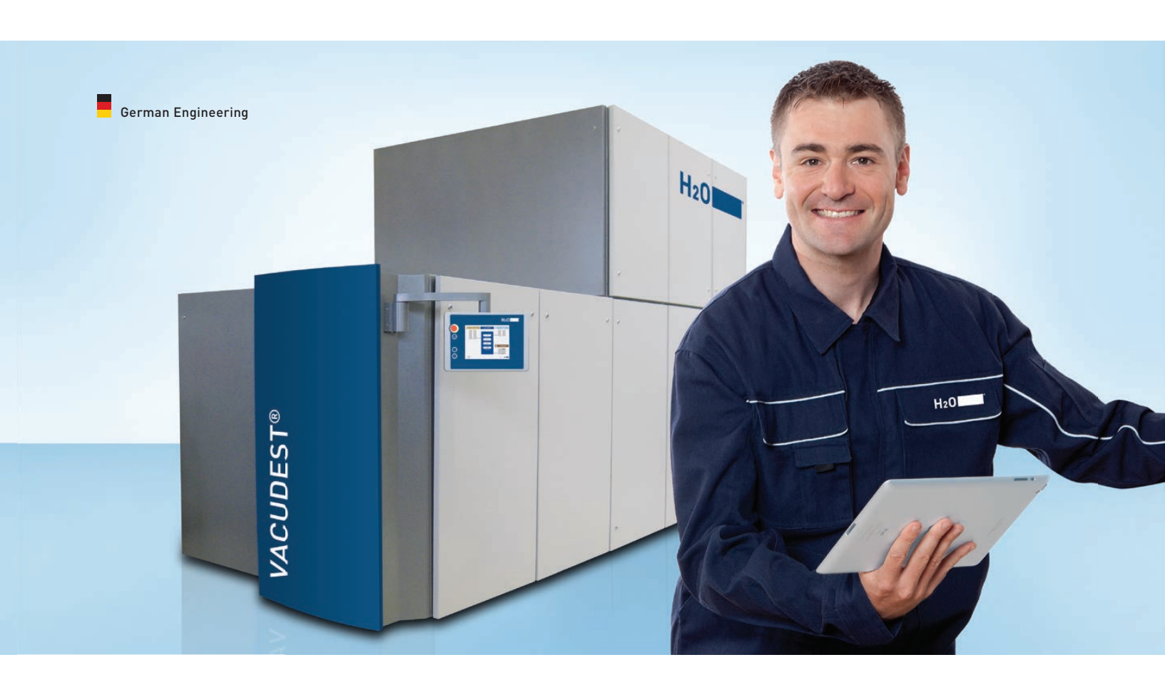
H20. Effective and Reliable Process Solutions. For a future free of wastewater.